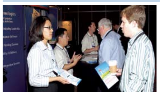
EXHIBIT FLOOR + DELIVERABILITY CLINIC + NETWORKING LOUNGE HOURS:

Sunday, March 4, 5:00pm-7:00pm Monday, March 5, 7:00am-6:00pm Tuesday, March 6, 7:00am-5:00pm